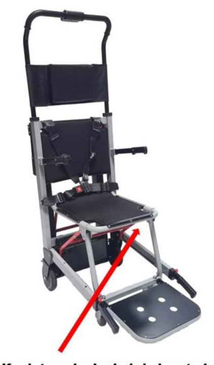
Knob to unlock chair is located under sear on RIGHT