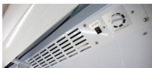
GPR-50-2: Fan, lamp switch, and temperature controller.

Energy efficient LED lighting helps maximize visibility and accessibility of samples.