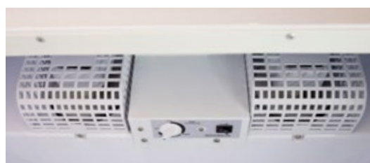
GPR-22-1: Fan, lamp switch, and temperature controller.