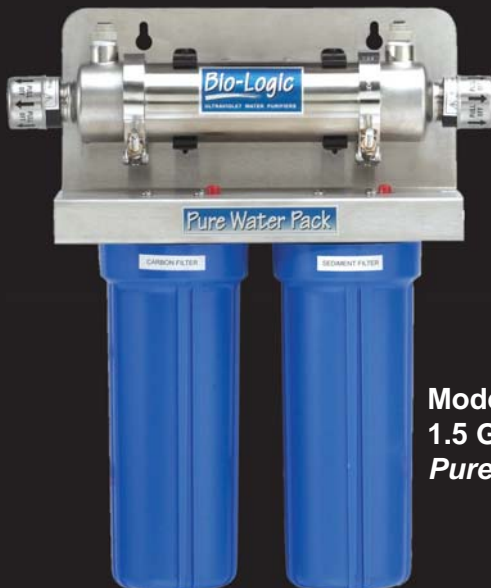
Model 1.5 GPM with Pure Water Pack™