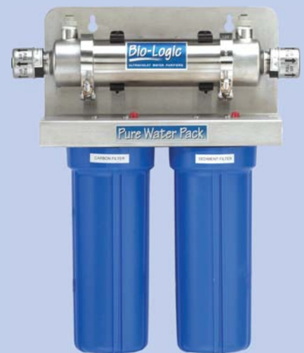
Model 1.5 GPM