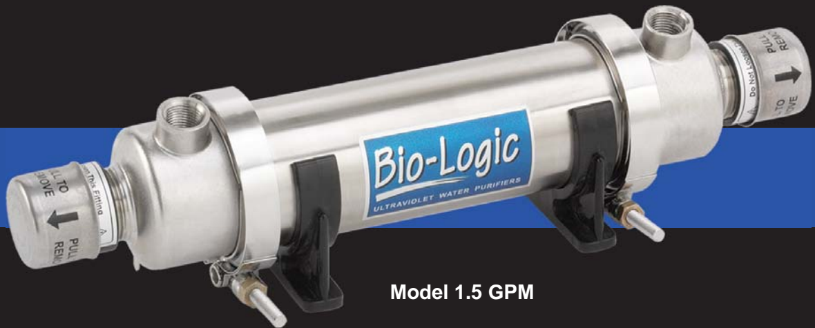
Model 1.5 GPM