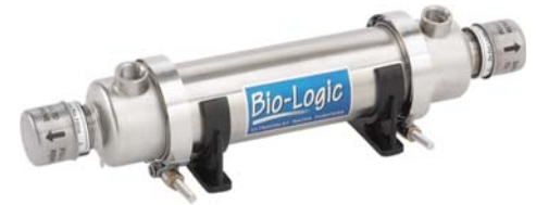
Model 1.5 GPM

The Bio-Logic ® Pure Water Pack ™ has been designed to provide adequate filtering and germicidal ultraviolet dosage.