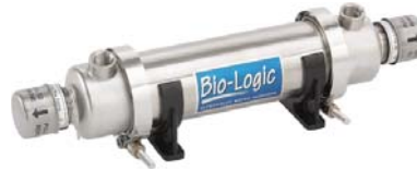
Model BIO-1.5 1.5 GPM