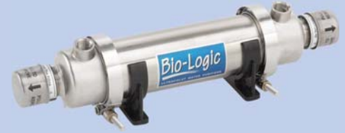
Model 1.5 GPM